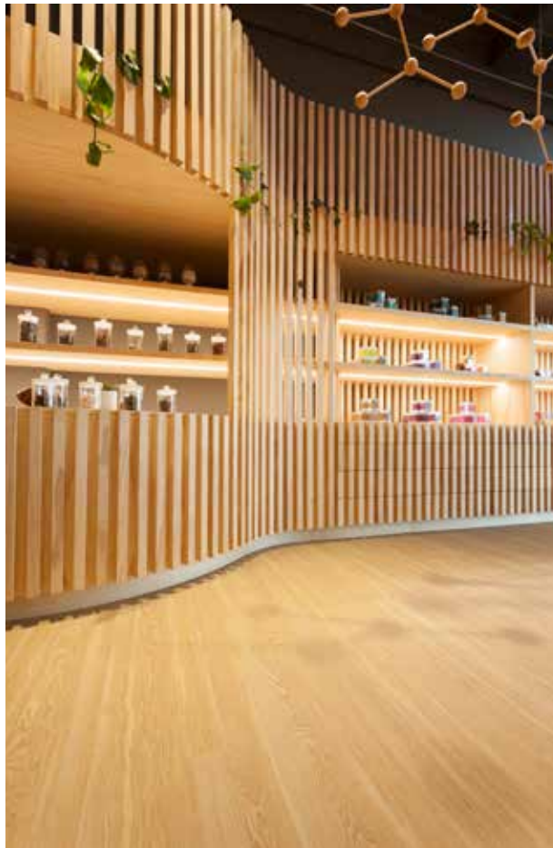
Project Case Study / Alpha