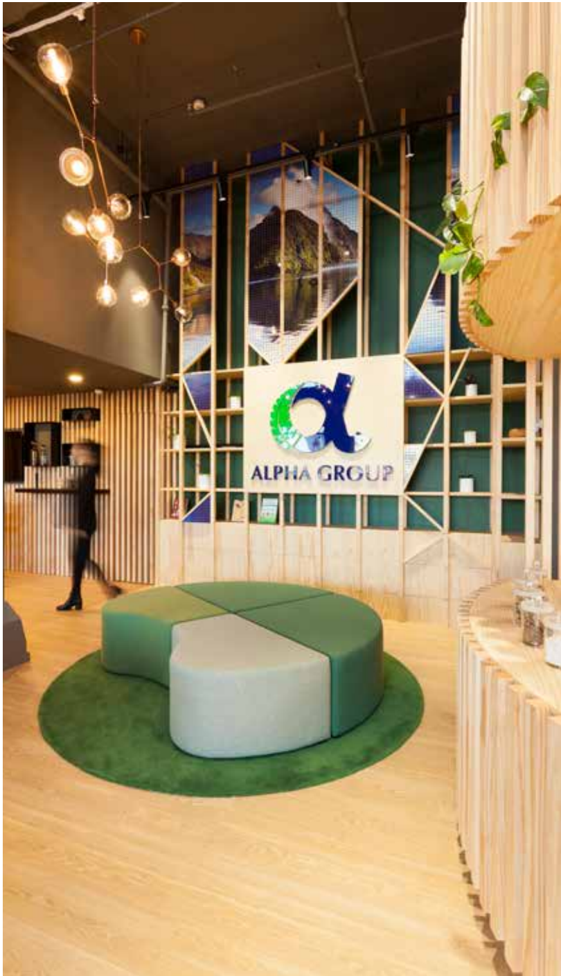
STACK / Workplace Design Brilliance